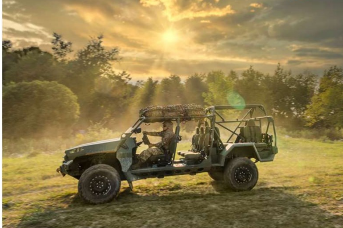
The Infantry Squad Vehicle from GM Defense.

Full-rate production decision from U.S. Army for Infantry Squad Vehicle